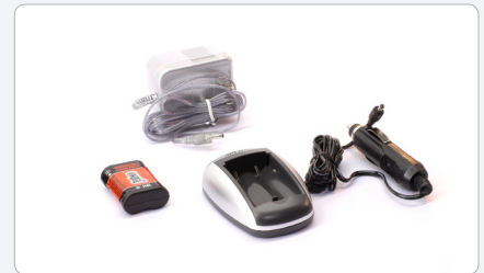
LRB 6/12K Rechargeable Kit