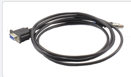
LRF GPS Cable