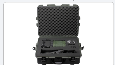
Hard Case with Optional Accessories