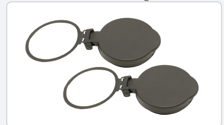
ARF Filter Caps