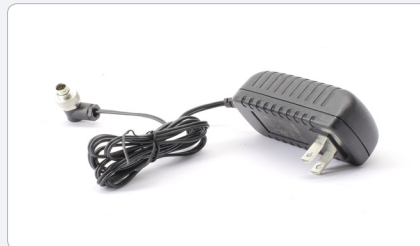
LRF AC/DC Adapter